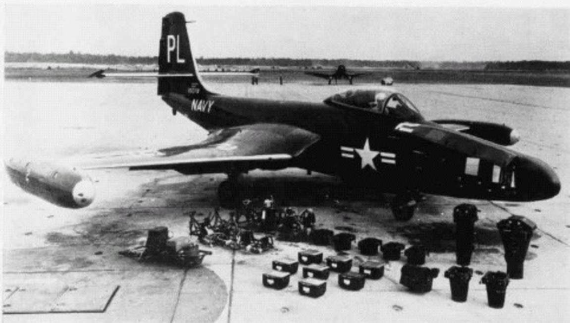
INSTALLED IN THE PHOTO-SANSHEE'S NOSE, THESE AERIAL CAMERAS CAN MAKE DAY OR NIGHT, OBLIQUE OR VERTICAL PHOTOS

have discharged their mission of conducting aerial photographic reconnaissance in support of fleet operations, of providing first phase photographic interpretation reports, and second phase damage assessment information.