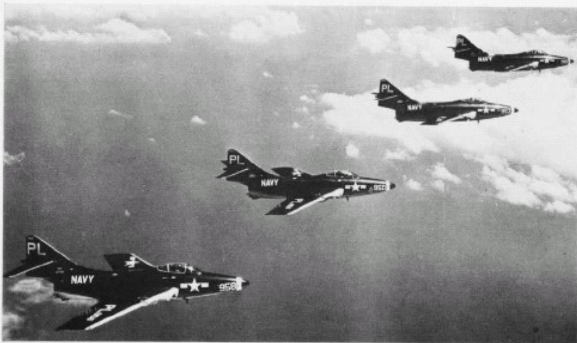
IN THESE SWEEP-WING COUGARS, VC-62 PILOTS HAVE RANGED OVER LARGE AREAS OF THE WORLD, SHOOTING PICTURES AS THEY GO

ranged over much of the world. Since her commissioning over 80 detachments have been supplied to 18 different carriers.