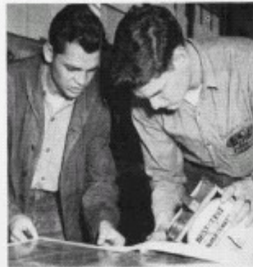
PHOTOGRS FINISH MULTI-STRIP MOSIAC MAP