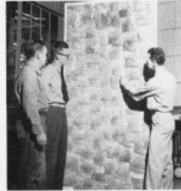
PHOTO INTERPRETERS STUDY COMPLETED MAP

From the very beginning, VC-62 has placed great emphasis on training. The ground and flight training syllabus devoted to aerial photography includes lectures, check-outs and demonstrations on the characteristics of films and lenses, on operation of aerial cameras, and on mapping mathematics.