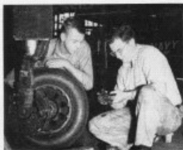
LUBE AND ELBOW GREASE FOR THE BANSHEES

That same year the first swept-wing photo-jets, F9F-6P Cougars saw service