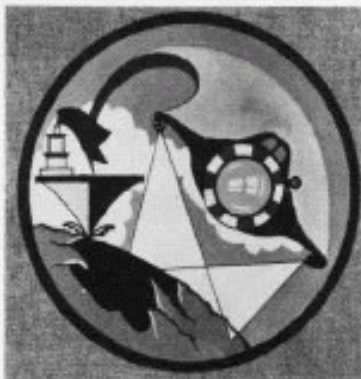
VFP-62'S JETS PHOTO MUCH OF THE WORLD

graphic reconnaissance squadrons were formed, VC-61 on the West Coast, and VC-62 on the East. Their mission was "to train and maintain the readiness of units for carrier-based photographic reconnaissance of designated targets in areas of naval operations." These squadrons would furnish detachments of photo-configured fighter aircraft and specially trained photo pilots to each deploying Air Group.