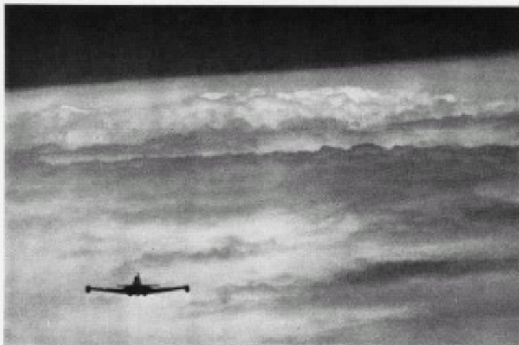
FIRST JET FLIGHT INTO HURRICANE. VC-62 PHOTO PLANE HEADS INTO CONNIE'S EYE

Nucleus of VC-62 was the FASRON Three Photo Unit at NAS NORFOLK. Numbering 15 officers and 88 men, VC-62 was commissioned in January 1949 with Cdr. W. O. Moore as first