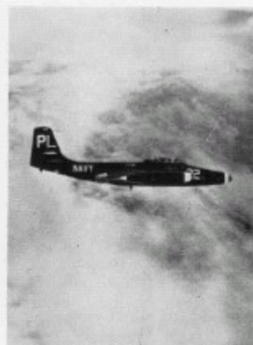
BANSHEE CAMERAS GET 'INSIDE EYE' VIEW