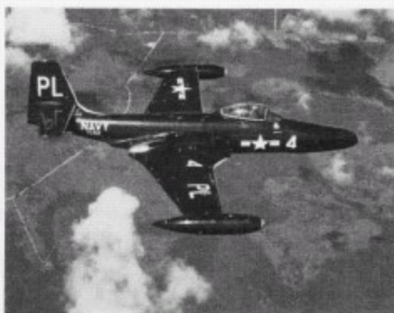
PHOTO CONFIGURED F2F-2P'S SERVED VC-62 IN EARLY YEARS F2H-2P BANSHEES WERE WELL SUITED FOR PHOTOGRAPHIC WORK