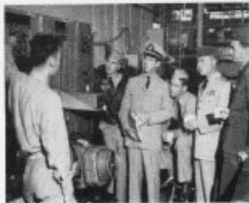
CHECK-OUT ON CAMERA CONTROLS SYSTEM